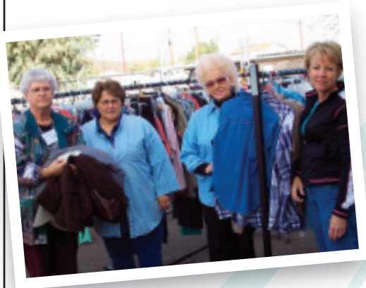
Volunteer Partner Volunteer Partners sort donations at the Distribution Center on 28th Street.