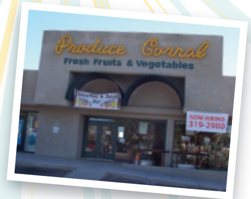
Canister – Business Partner Produce Corral uses GRM Canisters to help meet the needs of the poor & needy.