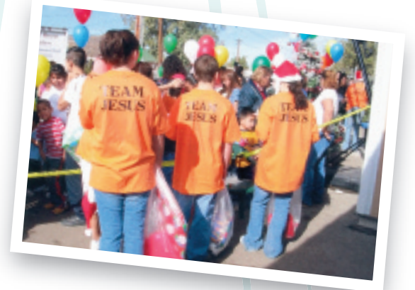
School Partner Pusch Ridge Christian School partners with GRM to meet the needs of children.