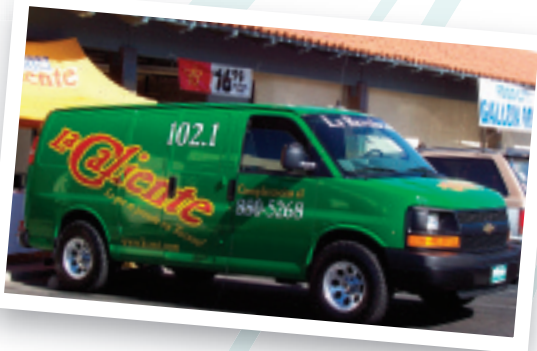
Business Partner El Caliente Radio station does live remote for Annual Street Banquets

Prayer Partner Prayer Partners are praying! Prayer is vital to the existence of the Gospel Rescue Mission of Tucson. Please join our Prayer Partner Team by going to www.grmtucson.com/prayer You will receive an email response and a weekly update on prayer needs and victories at the Mission.