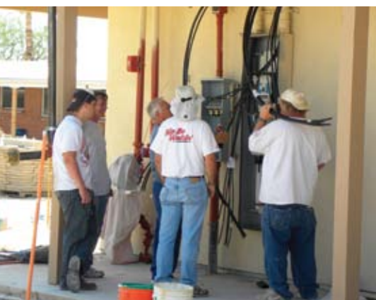
Final Electrical hook up in progress.