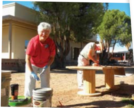
Volunteers/SOWERS refurbishing old doors.