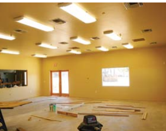
The new Chapel starts to take shape.

There have been hundreds of volunteers that have given well over 25,000 hours of time to keep the dream moving forward. There is no way that we could list all of the people God has called to help us... we would forget so many... but God won't forget one!