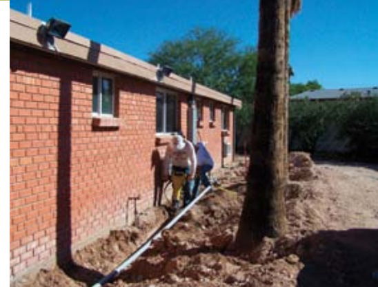
Volunteers lay electrical lines at New Women & Children's Center.