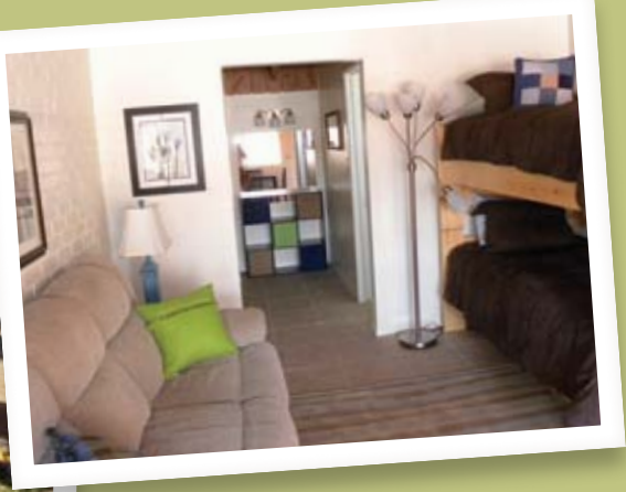
Guest rooms are starting to come together...Room 21 is finished.

These are just a few of the “Miracles on the Mile” that I have witnessed ...it has been an amazing journey so far and I can’t wait to see who God is going to touch to volunteer their labor and to donate additional finances in the upcoming months...to complete the project.