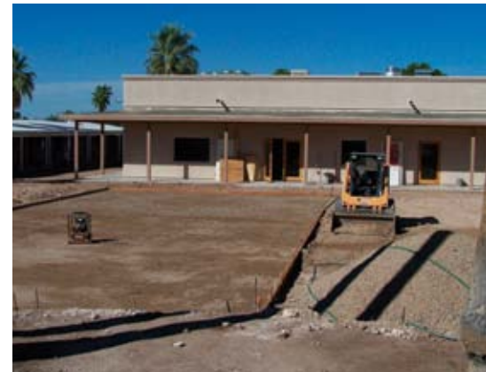
Future basketball and play court.