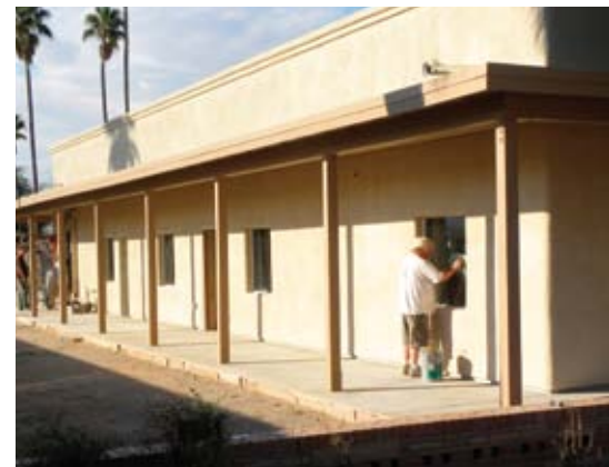
Looking good after a fresh paint job.